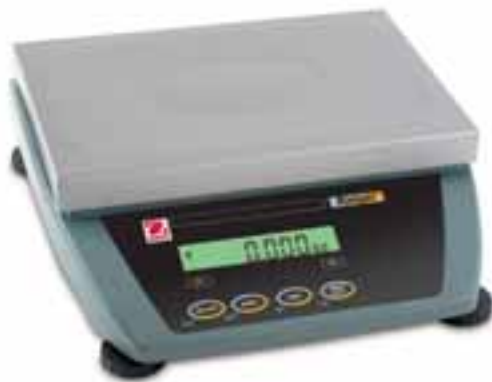
RD15LM, RD35LM models